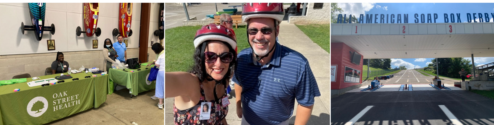
Vantage's AmeriCorps Seniors Recognition Event at the Soap Box Derby