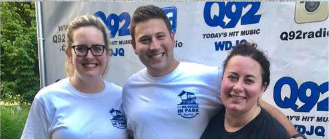
Put Hunger in Park Sponsorship Levels September 12, 2019 To learn more visit: www.vantageaging.org/puthungerinpark

*Adopt-a-Route partners must commit to Meals on Wheels' Adopt-a-Route program for one full year and make deliveries at least twice per month. Adopt-a-Route is available for Stark and Wayne Counties only.